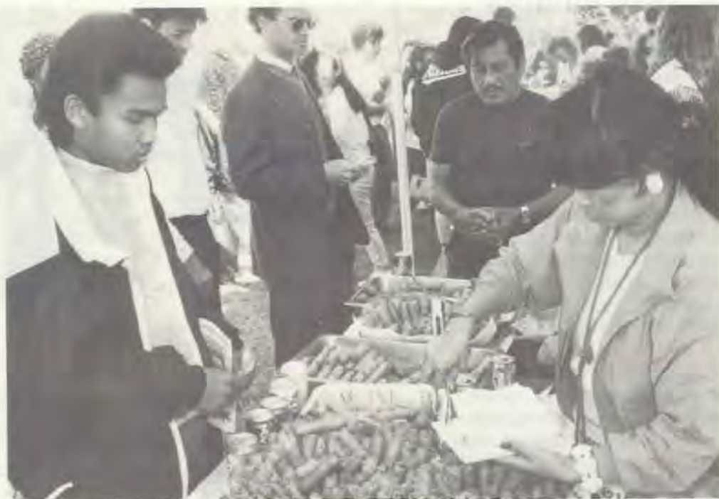
A visitor samples lumpia , a traditional Filipino food.

Language Day, a tradition at DLI for more than 25 years, attracts more visitors and becomes a bigger event every year. The visitors have the opportunity to consider language opportunities for the future, but no doubt the military students currently attending the Defense Language Institute will have memories of sharing their school and their chosen careers with their guests on Language Day 1991.