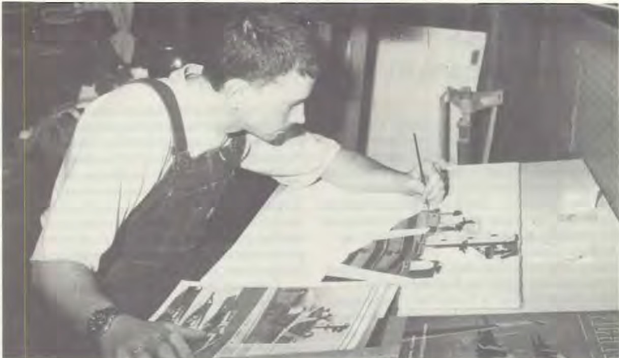
MSgt. Hal Moon works on a drawing of an aircraft carrier, following the dimensions determined in a technical manual. Moon spends long hours researching his subjects before actually drawing them.