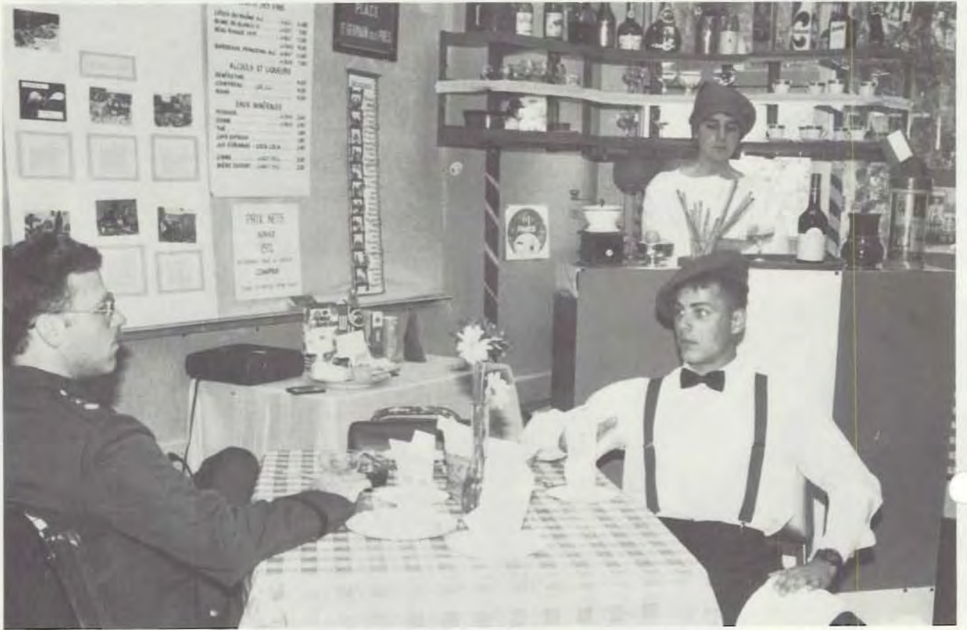
The French Department set up a cafe as one of the cultural displays for visitors.