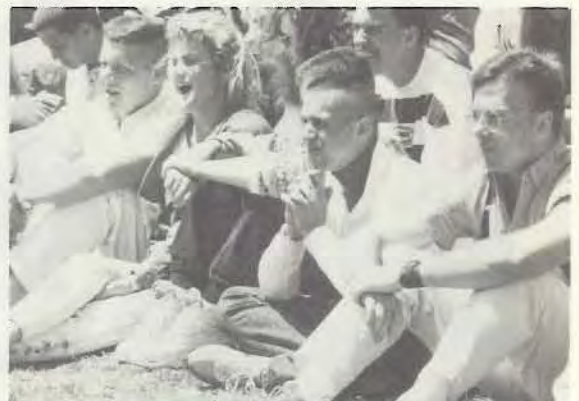
Onlookers enjoy show on outdoor stage.