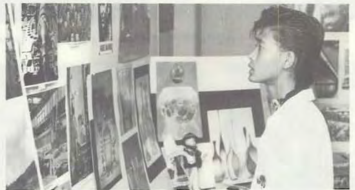
A visitor studies a Czechoslovakian display.