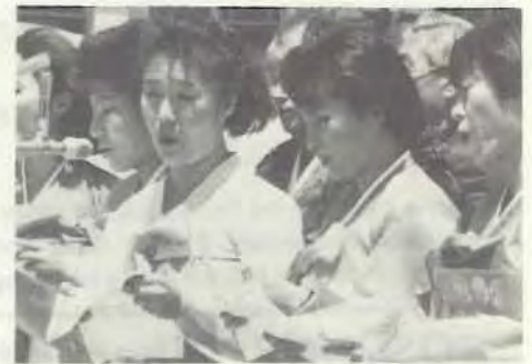
Korean singers perform.