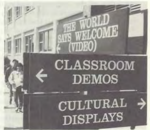
Guide signs offer directions.