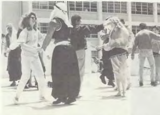
Visitors join DLI students in folk dance.