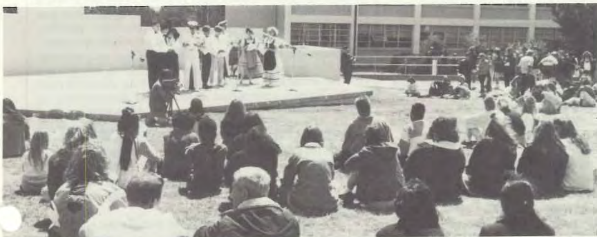
The language day crowd enjoys a lively performance by the French choir.