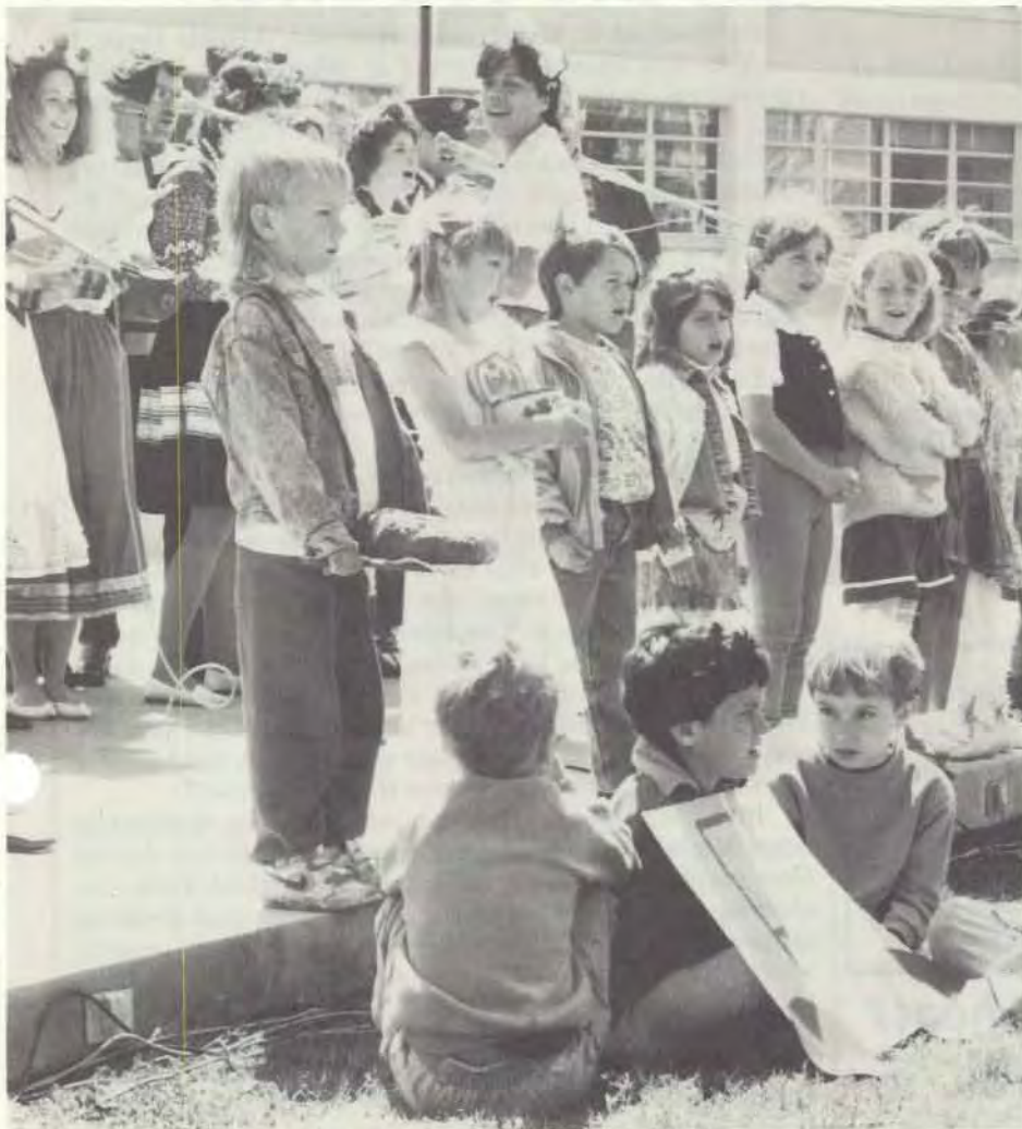
Local school kids join the Russian School 2 Kalinka Choir in performance.