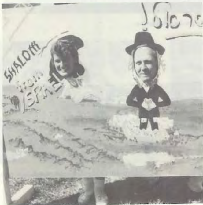
Hebrew Branch picture board draws posers.