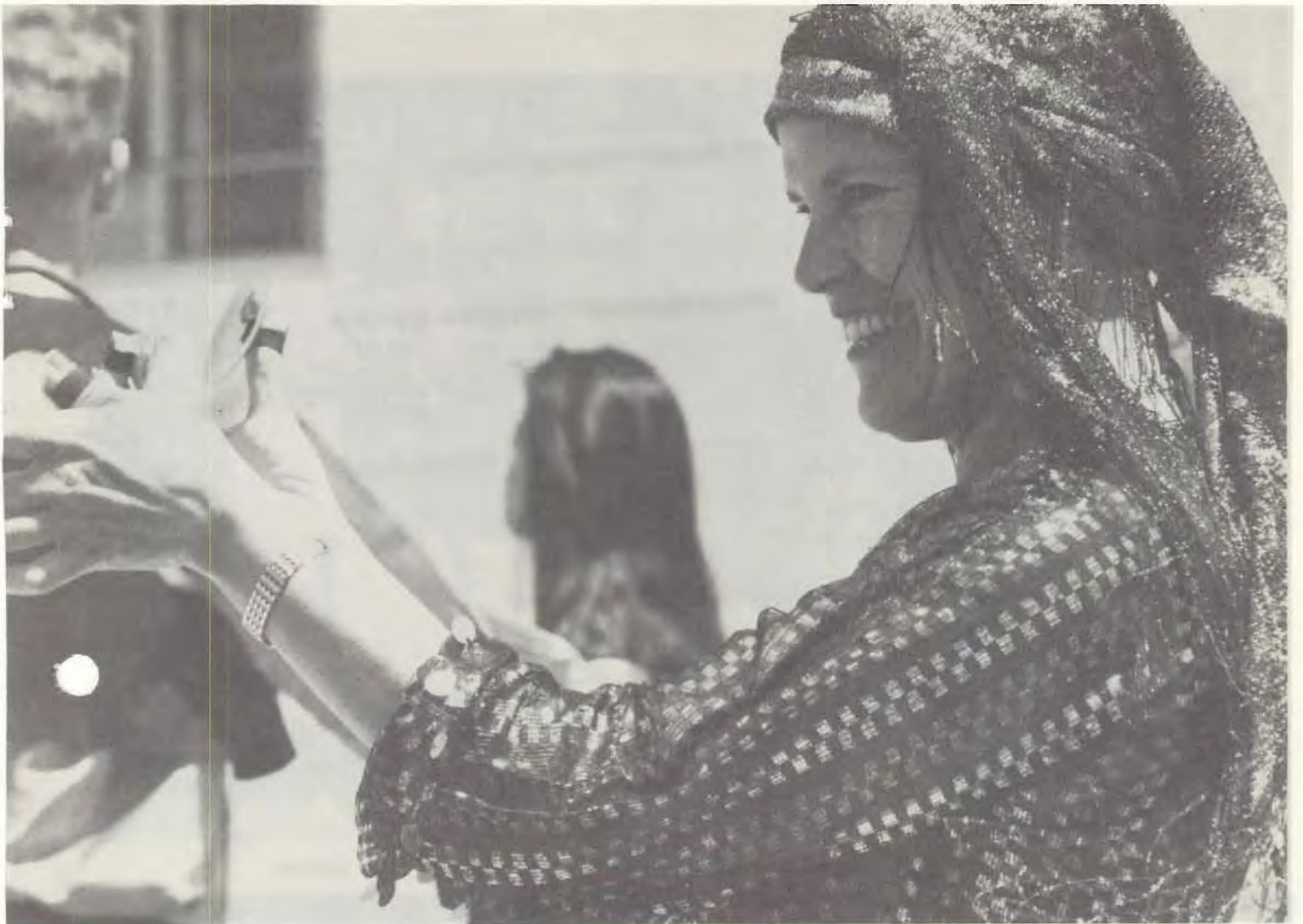
An Arabic dancer leads a group of students in an Arabic dance.