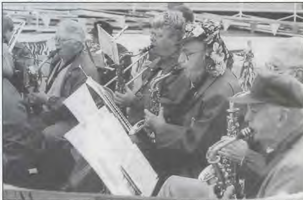
Volunteer musicians from the Monterey Community Band entertain Special Olympics athletes, family members and volunteers at the MPC football stadium.