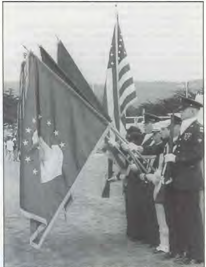
Members of the Joint Service Color Guard from the Presidio of Monterey and the Defense Language Institute Foreign Language Center open the ceremonies for the Monterey Bay Region Special Olympics at MPC football stadium.