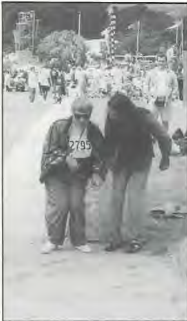
A Special Olympic athlete, assisted by her chaperone, prepares for her attempt in the standing long jump event at MPC.

ranging in age from 8 years up to people in their 50s, with differing levels of disabilities. This regional Special Olympics consists of athletes from Monterey, Santa Cruz and San Benito counties, who come from places like King City in the south up to the Santa Cruz mountains in the north.