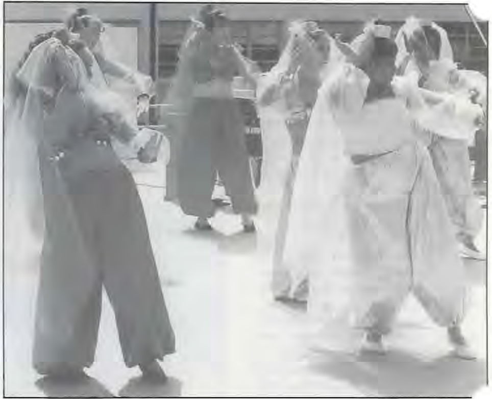
A group of Persian-Farsi student dancers entertain Language Day visitors on the outdoor stage.

A Persian dance performance was so well received that the dancers were called