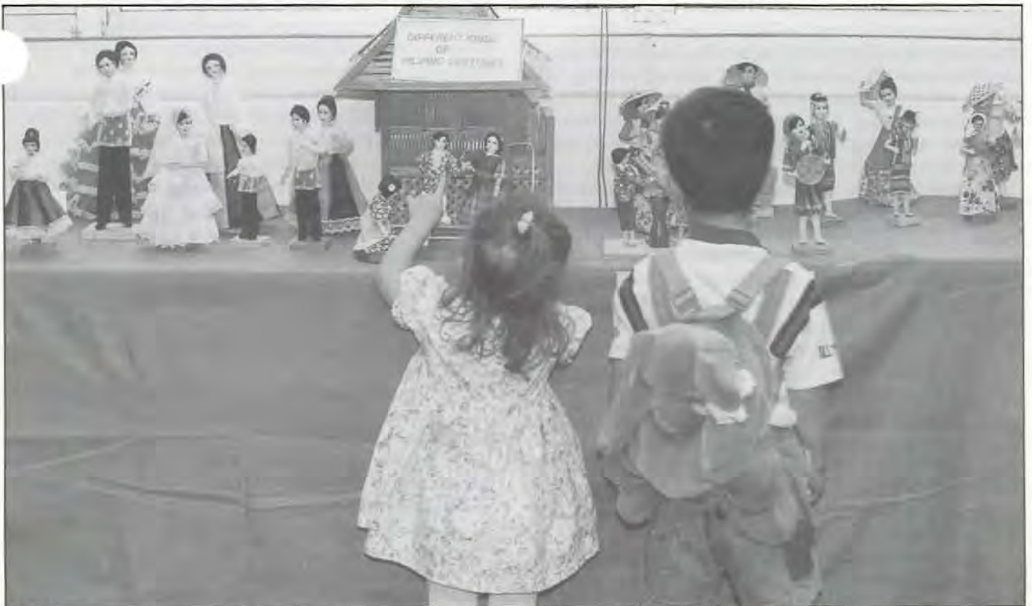
Cultural display including Filipino dolls attracts the attention of two young visitors during the events May 15.