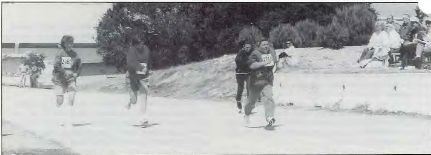
Special Olympic athletes run for glory in the 50-meter run at the Monterey Peninsula College track May 16. Winners from each heat earned gold, silver or bronze medals or ribbons. Athletes could compete in up to four different events.