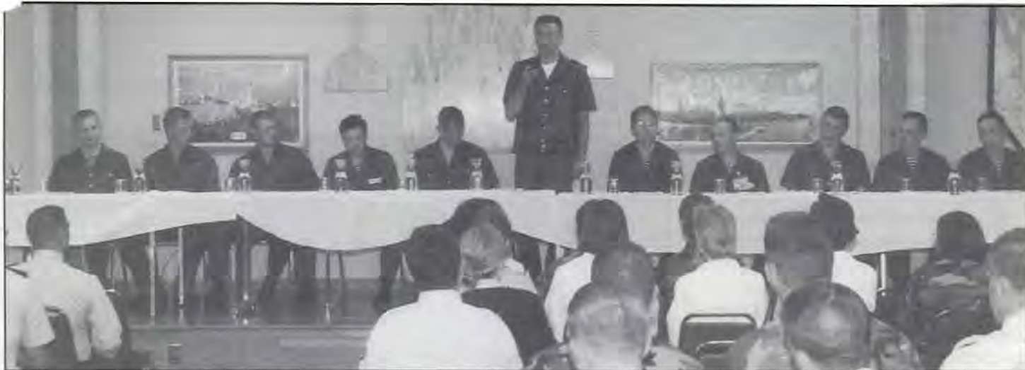
An officer of the Russian Naval Engineering Academy responds to a question from a DLI Russian student during a question and answer period at the Nicholson Hall Auditorium May 21.