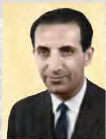
Circa 1965