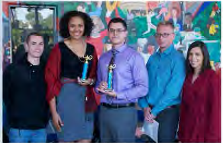
DLIFLC students receive awards at CLTAC in San Francisco April 26.

This year, 35 students from DLIFLC made the trip to San Francisco to compete, accompanied by fellow students, friends and more than 60 DLIFLC faculty members who attended to encourage and cheer them on. According to the official CLTAC record, 15 DLIFLC students won awards, five of whom took first-place honors in their categories.