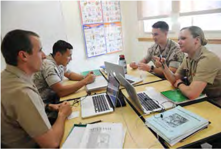
Spanish language students practice speaking.