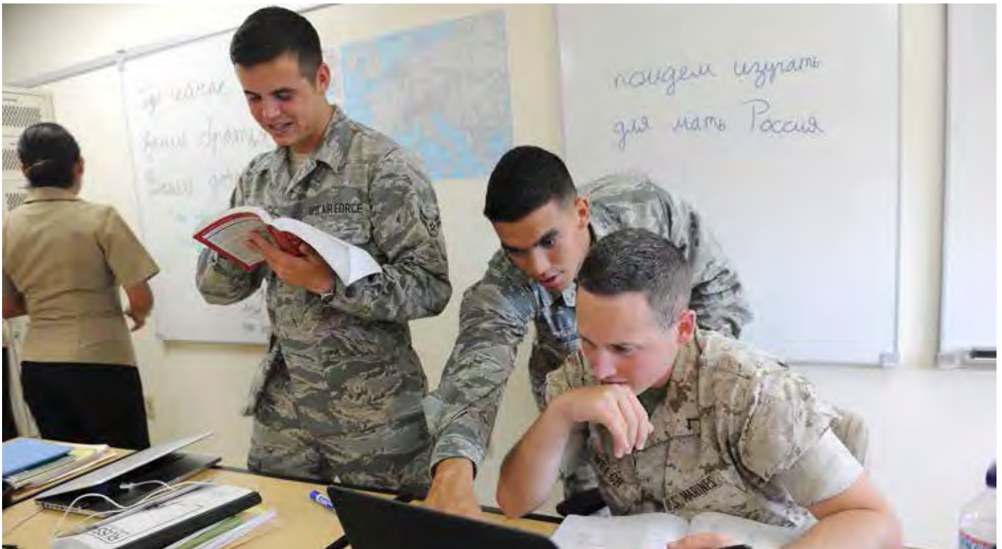
Students in their third week of Russian Language studies, diligently practice writing in the Cyrillic alphabet and compose their first phrases.