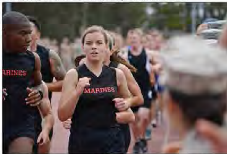
A Marine runner encourages a teammate during the Commander's Cup race held at the Price Fitness Center track Aug. 21.

Race two began with the Air Force setting the pace, leading after five laps. In the end, the Army took over, winning once again, with the Marines coming in second, followed by the Air Force and the Navy.