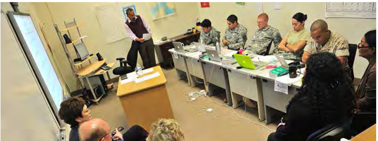
Governor Jerry Brown's Military Council members observe service members studying Arabic at DLIFLC and the Presidio of Monterey June 16. Council members visited the Presidio of Monterey as part of a fact finding tour of California military installations and their impact on national security and the state's economy.

The Governor's Military Council's goal is to compile information on each installation in order to write a report and strategic plan to protect California's military installations and operations amid ongoing DoD budget cuts and force reduction after the wars in Iraq and Afghanistan. The Council was established by Brown in 2013 and is composed of retired admirals and generals from the U.S. Army, Marine Corps, Navy, Air Force and Coast Guard, as well as a number of business leaders.