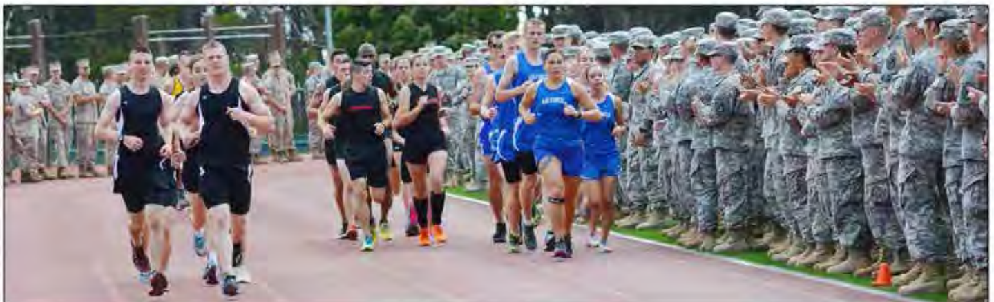
Coed teams compete against each other in the Commander's Cup race on Aug. 21.

The next Commander's Cup is scheduled for November 5.