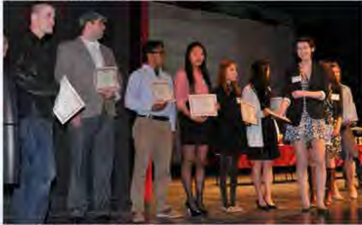
Service members studying Mandarin Chinese at the Defense Language Institute Foreign Language Center received awards and applause from the more than 1,000 attendees at the conclusion of the 39th Annual Mandarin Speech Contest at the Lowell High School auditorium in San Francisco April 26.

SAN FRANCISCO, Calif., - Service members studying Mandarin Chinese at the Defense Language Institute Foreign Language Center, Presidio of Monterey, made the trek north to test their skills and compete for honors at the 39th Annual Mandarin Speech Contest in San Francisco April 26.