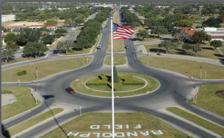
Randolph AFB, Texas, Washington Circle

By Maj. Will Cambardella, Air Force Culture and Language Center Public Affairs