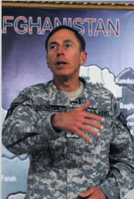
International Assistance Security Force (ISAF) commander, Gen. David Petraeus, speaks to AF/PAK Hands members at a Shura in Kabul on Oct. 6, 2010.