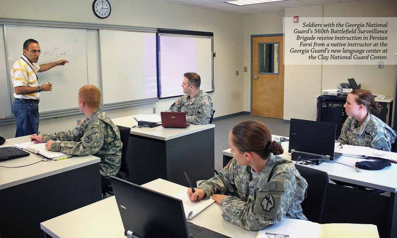
Soldiers with the Georgia National Guard's 560th Battlefield Surveillance Brigade receive instruction in Persian Farsi from a native instructor at the Georgia Guard's new language center at the Clay National Guard Center.