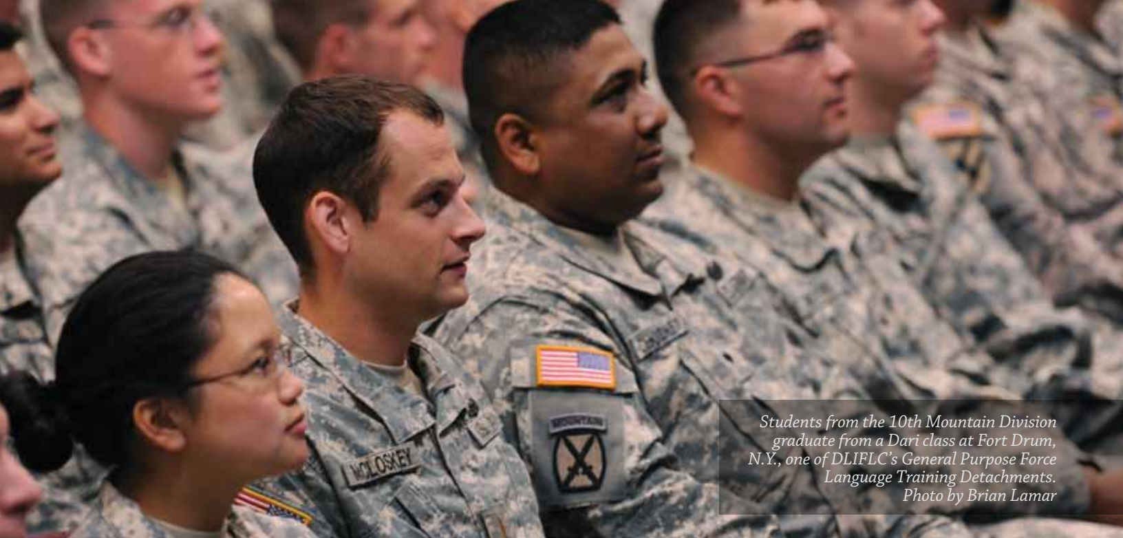
Students from the 10th Mountain Division graduate from a Dari class at Fort Drum, N.Y., one of DLIFLC's General Purpose Force Language Training Detachments.