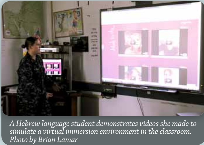
A Hebrew language student demonstrates videos she made to simulate a virtual immersion environment in the classroom.